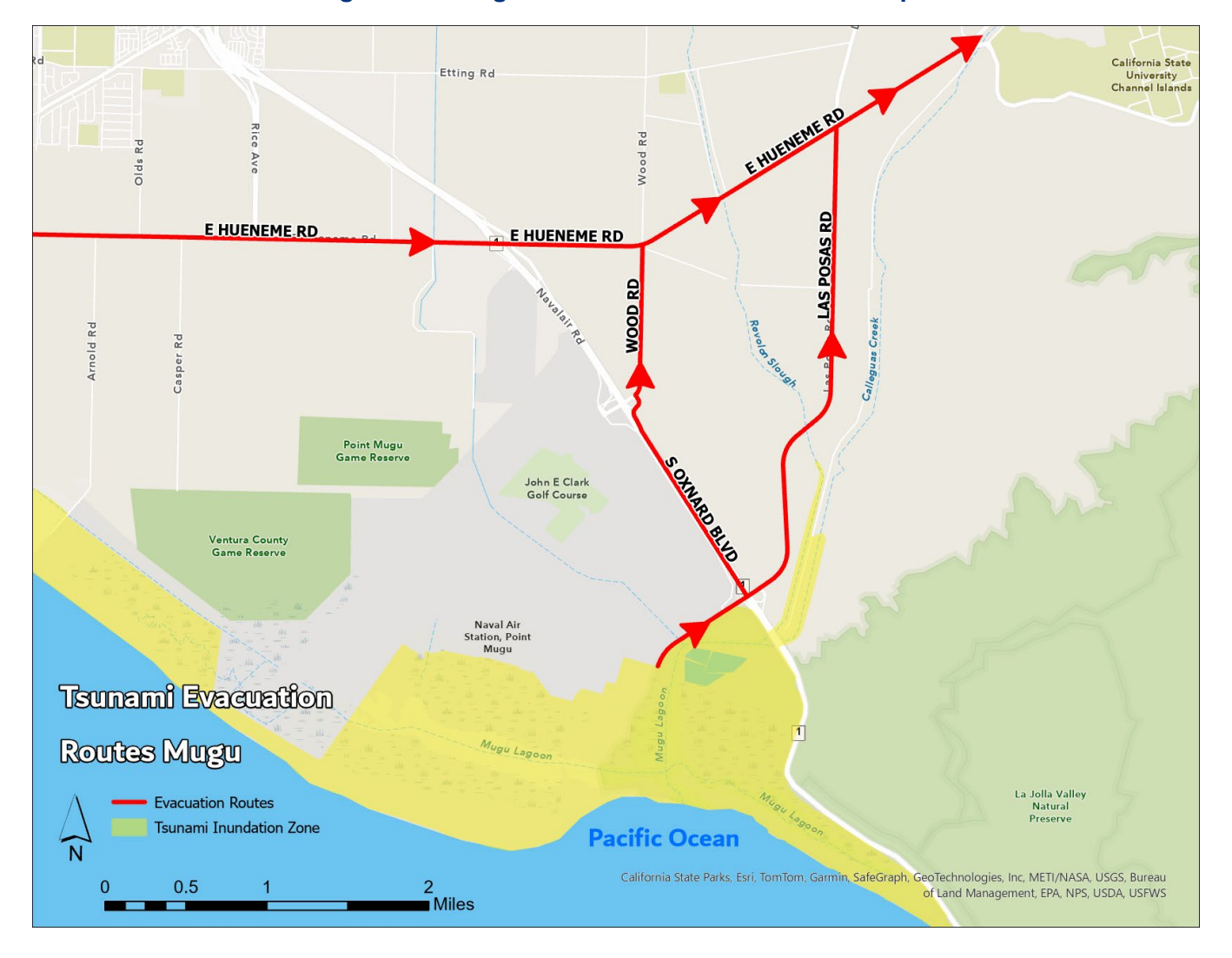
Figure E-6. Mugu Tsunami Evacuation Route Map