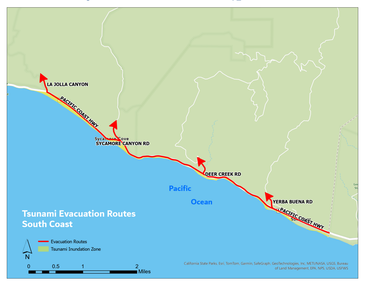
Figure E-3. Tsunami Evacuation Route Map_South Coast