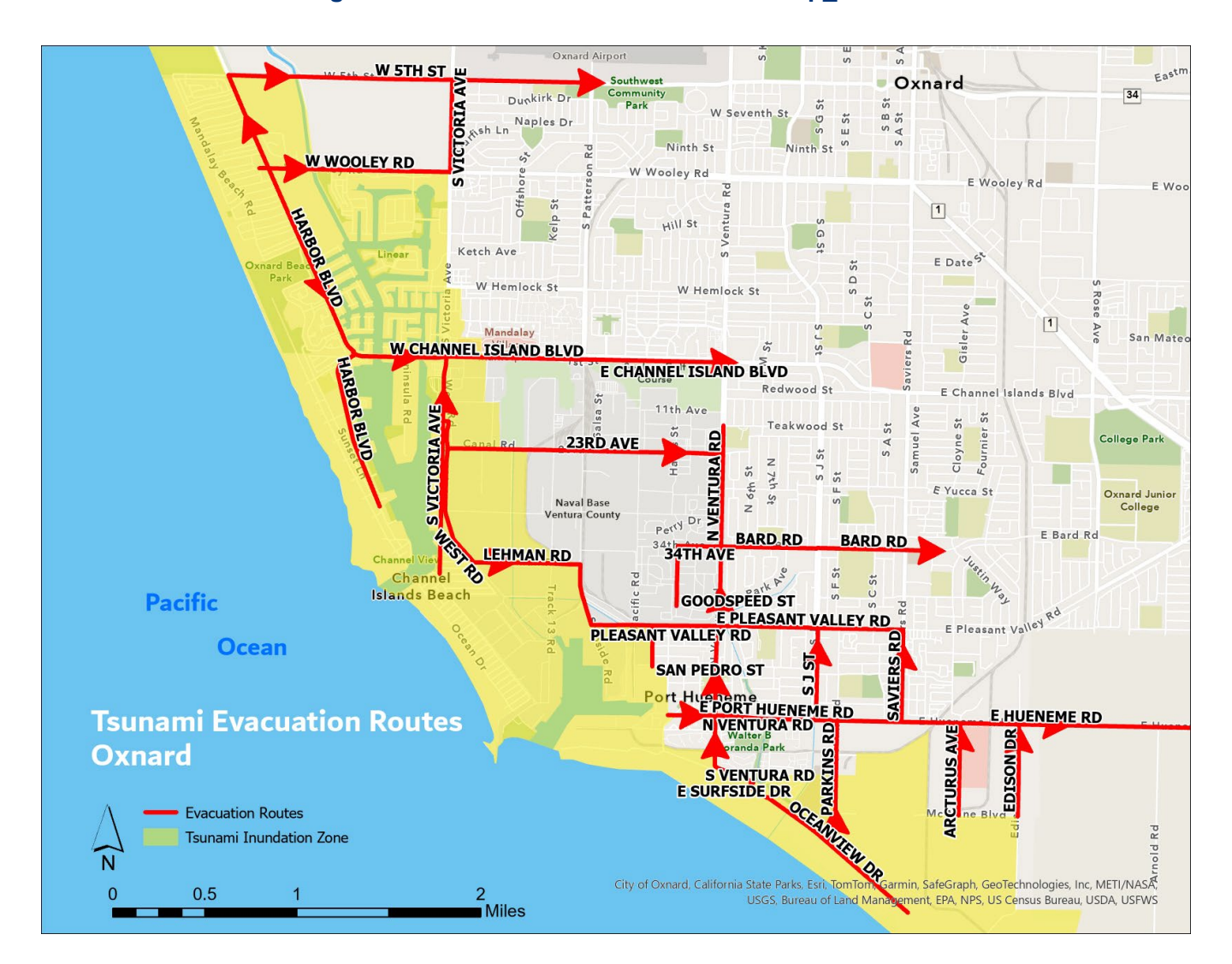
Figure E-5. Tsunami Evacuation Route Map_Oxnard