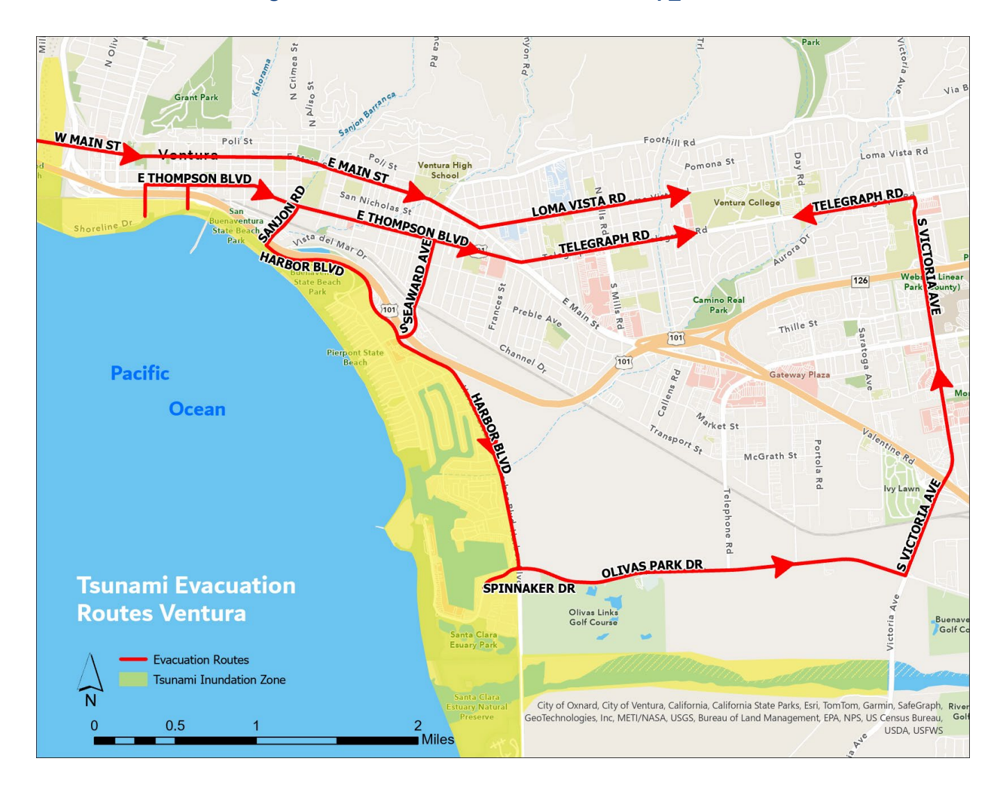
Figure E-4. Tsunami Evacuation Route Map_Ventura