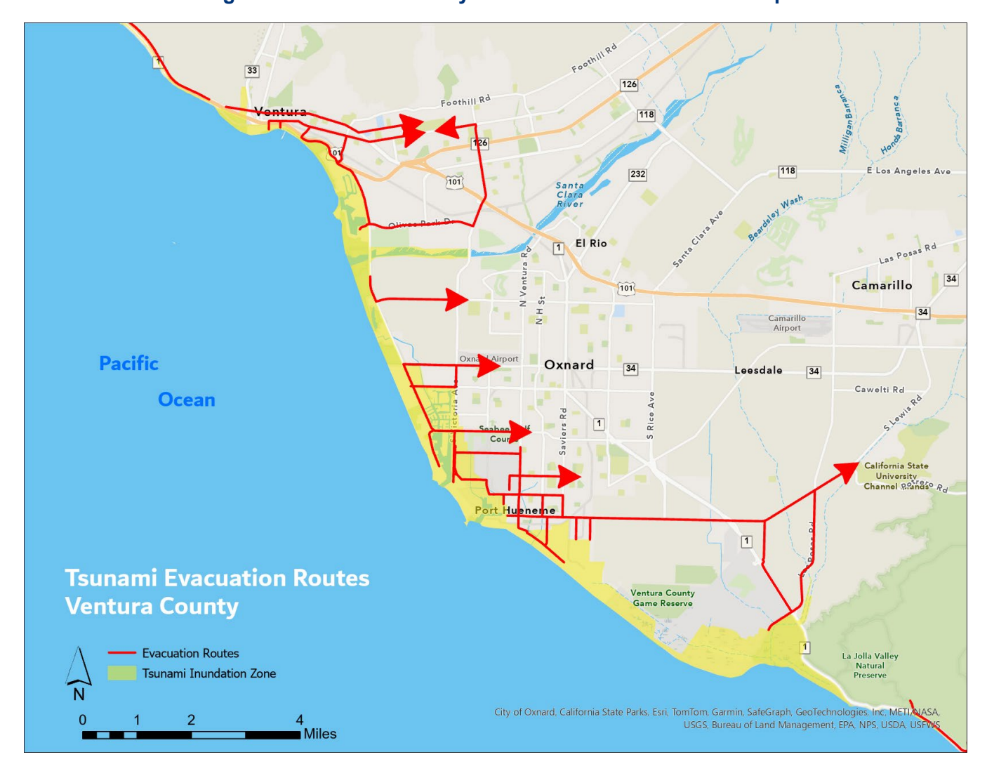
Figure E-1. Ventura County Tsunami Evacuation Route Map