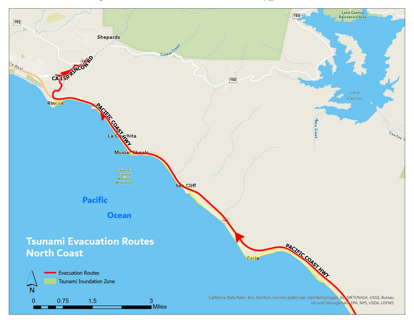
Figure E-2. Tsunami Evacuation Route Map_North Coast